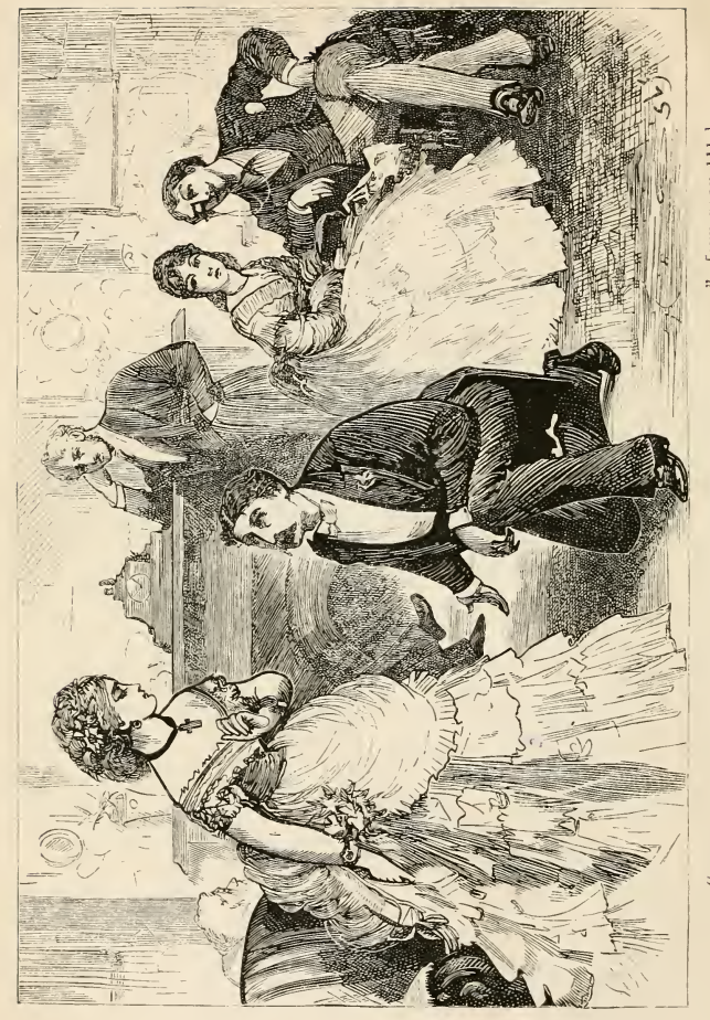
"HE KNELT DOWN ON ONE KNEE BEFORE HER, AND KISSED HER HAND."—[SEE PAGE 111.]